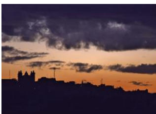
Paris Roissy CDG 📍 ✈️ 8500km - ⌚ 10h Antananarivo 📍