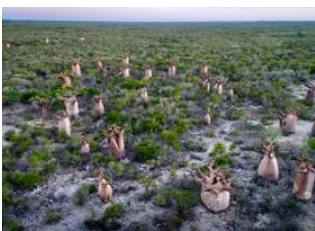
Morombe 📍 🚗 75km - ⌚ 3h Andavadaoka 📍 Andavadoaka 📍