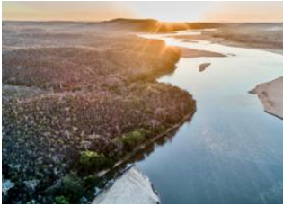
Kirindy Mitea National Park 📍 🚗 160km - ⌚ 10h Mangoky river 📍