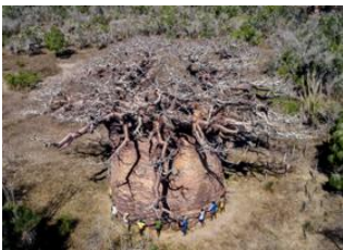
Mangoky river 📍 🚗 80km - ⌚ 3h Morombe 📍