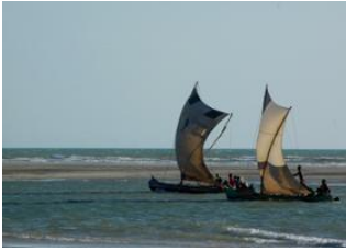
Bekopaka 10km - 15m Bekopaka