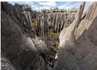
Bekopaka 20km - 2h Tsingy of Bemaraha Bekopaka