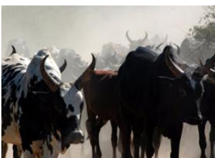
Bekopaka 200km - 6h Morondava