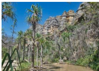
Ranohira 📍 13km - ⌚ 5h Ranohira 📍