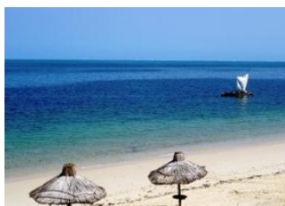
Ranohira 📍 🚗 250km - ⌚ 4h Tulear 📍 🚗 45km - ⌚ 45m Ifaty 📍